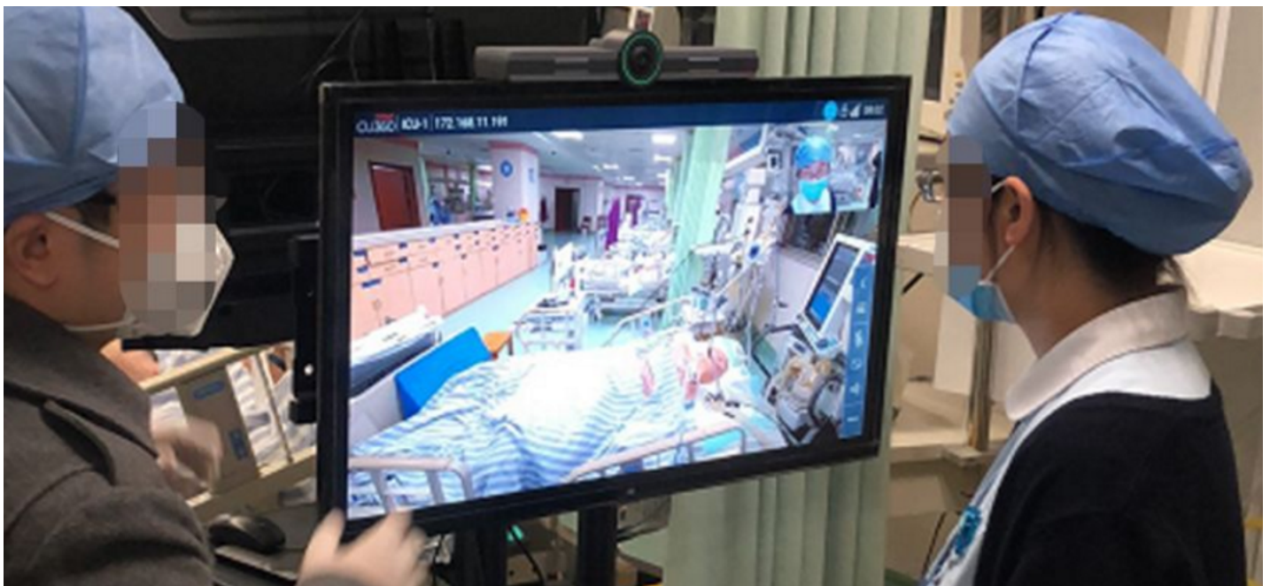
Healthcare workers using remote visiting systems

Ahead of the deployment, Avaya sent two teams of engineers to the hospital for commissioning and training. It soon transpired that a key requirement of the ICU ward was stability, meaning that an on-premise solution was required. As a result, Avaya engineers re-developed the hospital's network so that it could accommodate the ICU ward's medical applications as well as the new remote visitation application. The solution enables point-to-point high-definition audio and video communication between the isolation ward and the visiting area through a local area network. The equipment was then deployed and is now being operated on the front line of epidemic prevention, control and treatment.